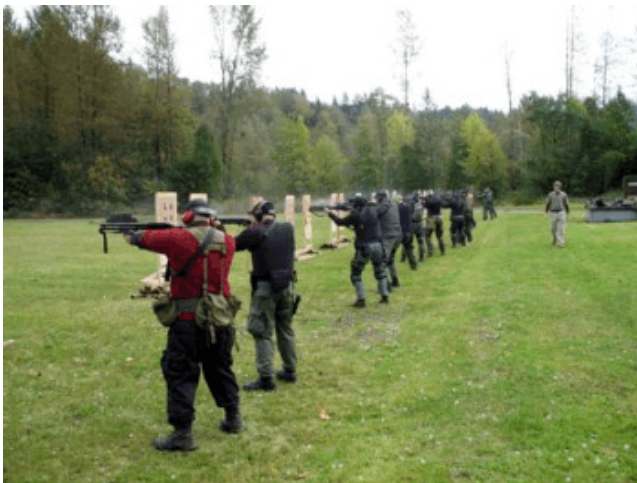
Shotgun Firing Line