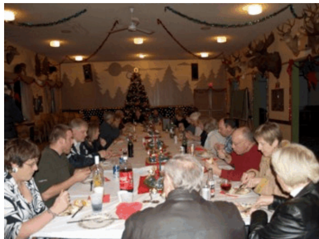
Black Powder, Pot Luck Xmas Dinner