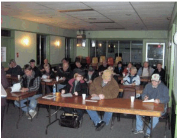
Club Members Completing Questionnaire